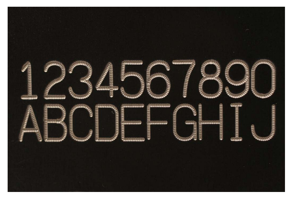
SAMPLE PIC. : The above sample is standard character quality of MarkinBOX.