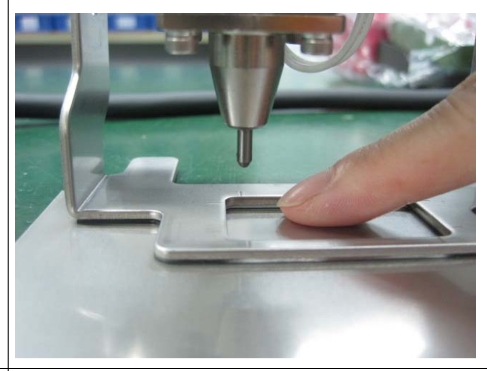
Too far distance between the pin and workpiece.